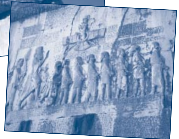
(Below) Rock relief at Beisitun.