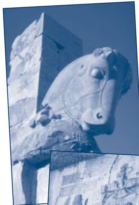
(Left) The gates of Persepolis.