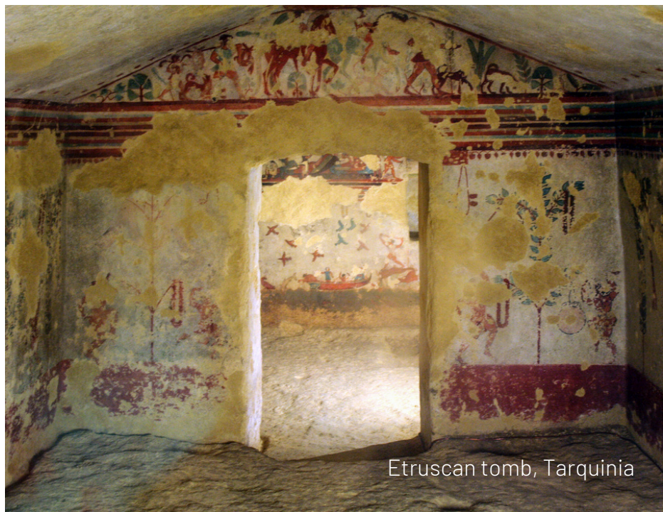
Etruscan tomb, Tarquinia

Changes in our itinerary, accommodations, and transportation schedules may occur while traveling. While we are committed to keeping as close to the published details as possible, sometimes it is simply not possible. Weather events, government affairs, or other factors out of our control sometimes come into play. A good book to read as well as patience, flexible attitude, and a sense of humor are essential.