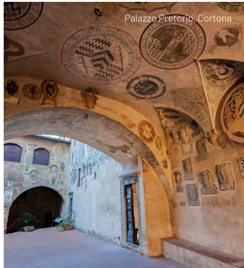
Palazzo Pretorio, Cortona

Overnight for two nights at the Hotel San Luca. (B/L/D)