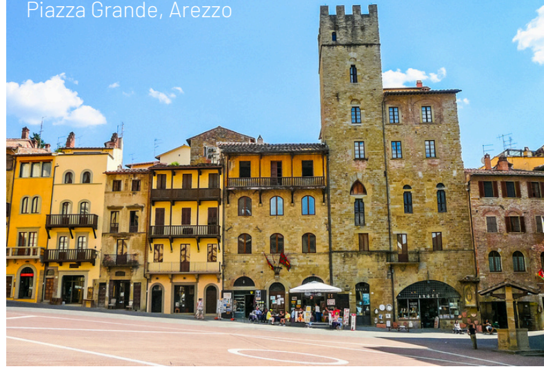
Piazza Grande, Arezzo