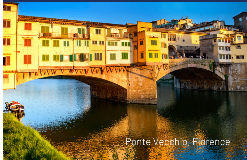
Ponte Vecchio, Florence