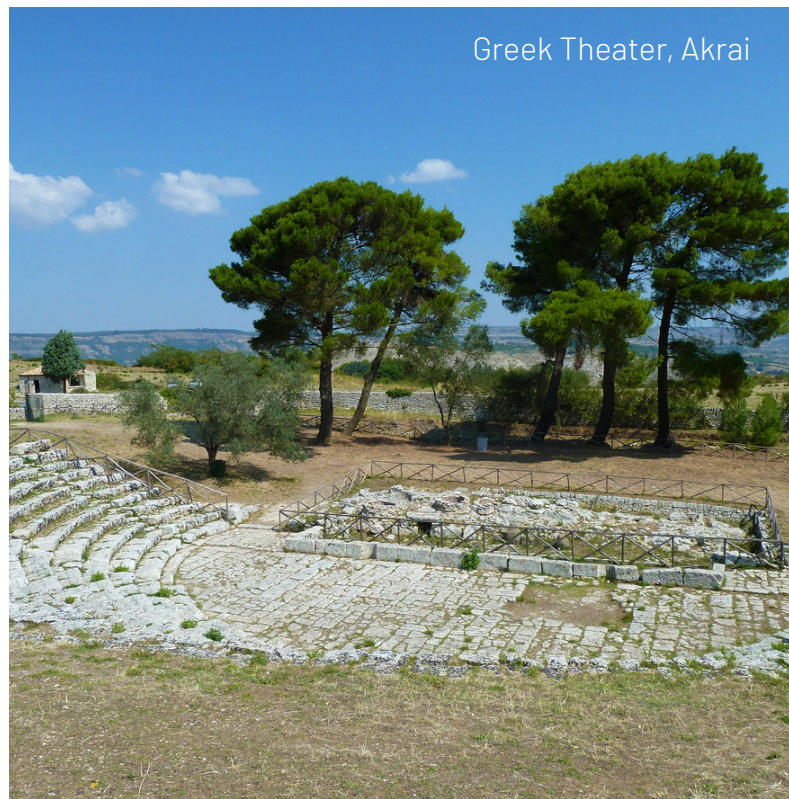
Greek Theater, Akrai

After a private boat ride on Siracusa Bay, this evening's dinner is on our own. (B/L)