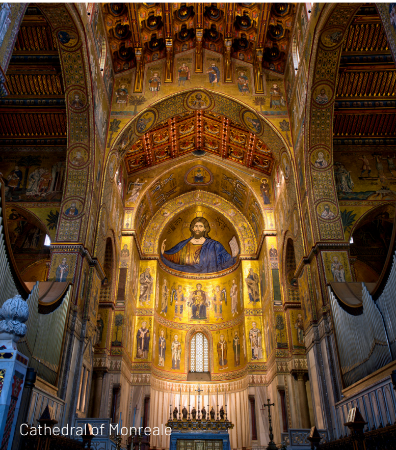
Cathedral of Monreale

Continue to Marsala where we spend two nights. (B/L/D)