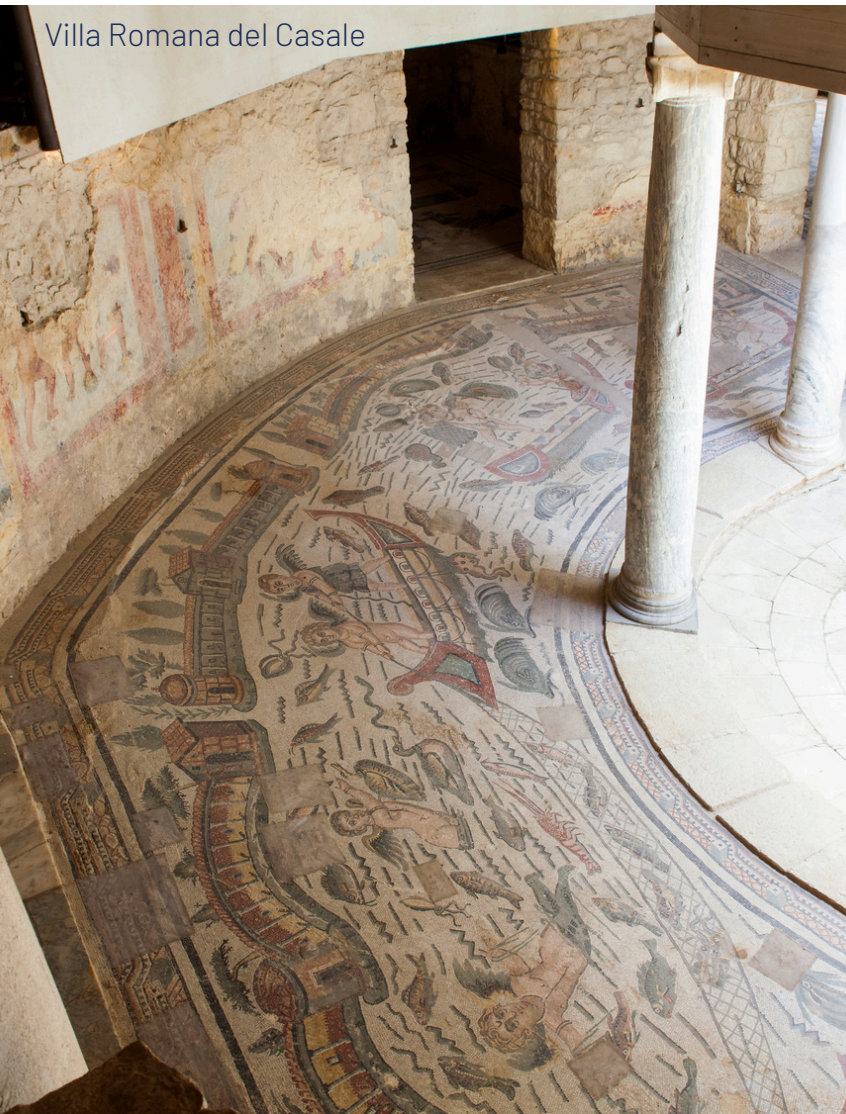
Villa Romana del Casale

Far Horizons offers pre or post extensions for many of our trips. We can also arrange extra nights at the arrival and departure hotel should you wish to arrive early or depart later. Please contact us for details.