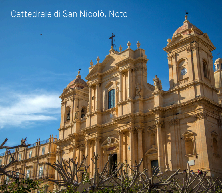
Cattedrale di San Nicolò, Noto