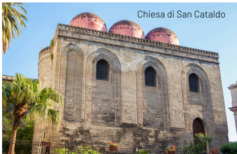
Chiesa di San Cataldo

A deposit of $1000 per person is required along with your registration & health forms, which will be linked in the email confirmation you receive once you pay your deposit on our booking platform. Final payment is due 120 days before departure. Prior to departure, you will be sent a reading list and a tour bulletin containing travel information.