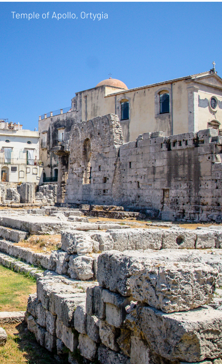
Temple of Apollo, Ortygia

Drive on to Taormina to enjoy the evening at our own pace. Overnight for two nights in a hotel overlooking the sea in Taormina. (B/L)