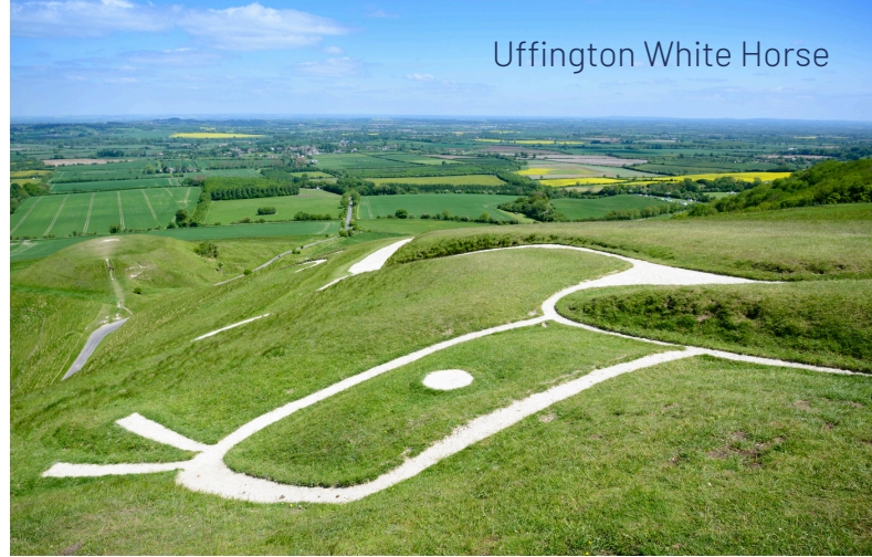
Uffington White Horse