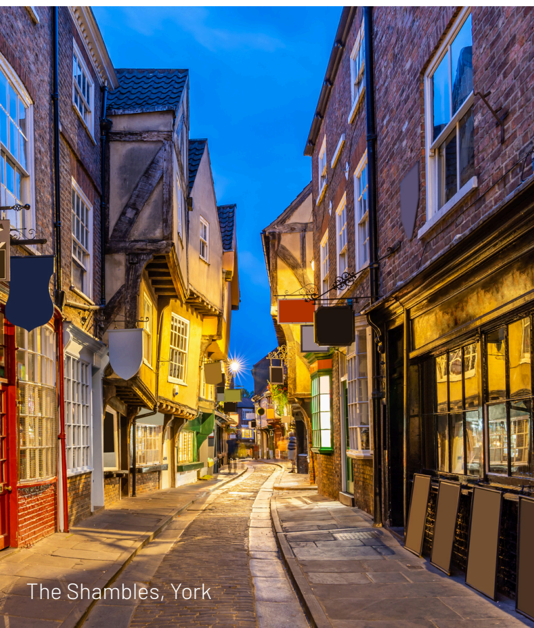
The Shambles, York

Lunch will be in one of York's many medieval pubs. (B/L/D)