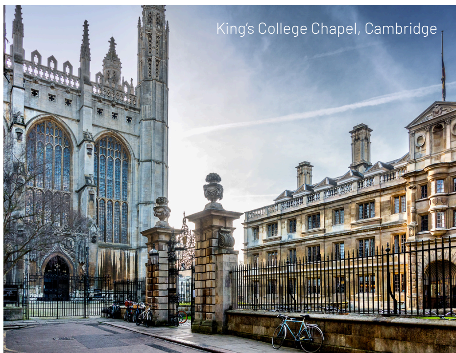
King's College Chapel, Cambridge

Changes in our itinerary, accommodations, and transportation schedules may occur while traveling. While we are committed to keeping as close to the published details as possible, sometimes it is simply not possible. Weather events, government affairs, or other factors out of our control sometimes come into play. A good book to read as well as patience, flexible attitude, and a sense of humor are essential.