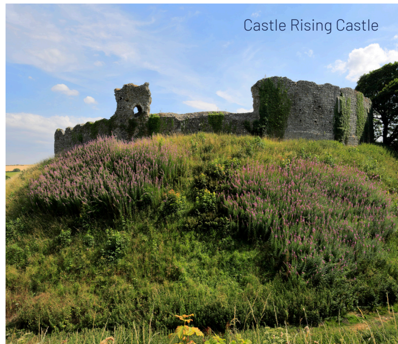
Castle Rising Castle

Our final stop will be at Flag Fen, where residents in 1350 BC fortified their meadows from neighboring communities by constructing a long defensive wall using hundreds of thousands of timbers. (B/D)