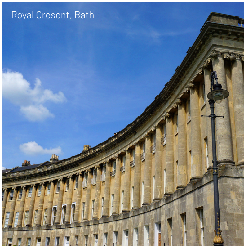
Royal Crescent, Bath

After lunch in The Giant, a former coaching house in the heart of Cerne Abbas, we move on to Old Sarum. This settlement began as an Iron Age British hill-fort known to the Romans as Sorviodunum, then became a Roman and Saxon town, and finally a Norman fortress and cathedral. As a key town in the ancient Saxon kingdom of Wessex, it was important for the Normans to control this site. Because of this, Henry I of England, son of William the Conqueror, used the site as a royal residence for much of his reign. The settlement was abandoned in 1219 when the bishops moved to New Sarum, now Salisbury. (B/D)